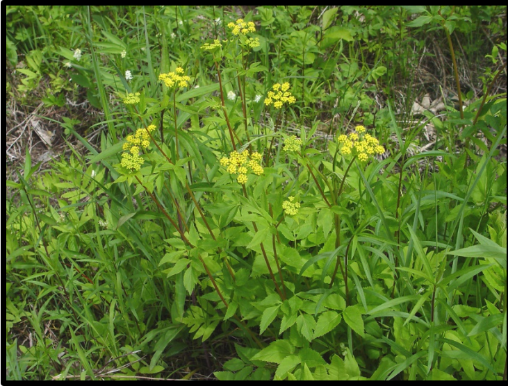
Golden Alexanders ( Zizia aurea )