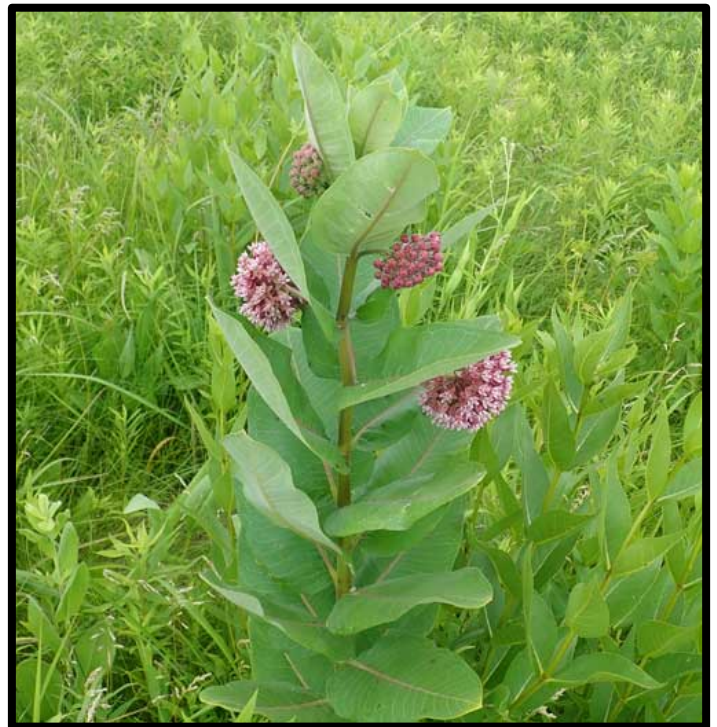
Common Milkweed ( Asclepius syriaca )