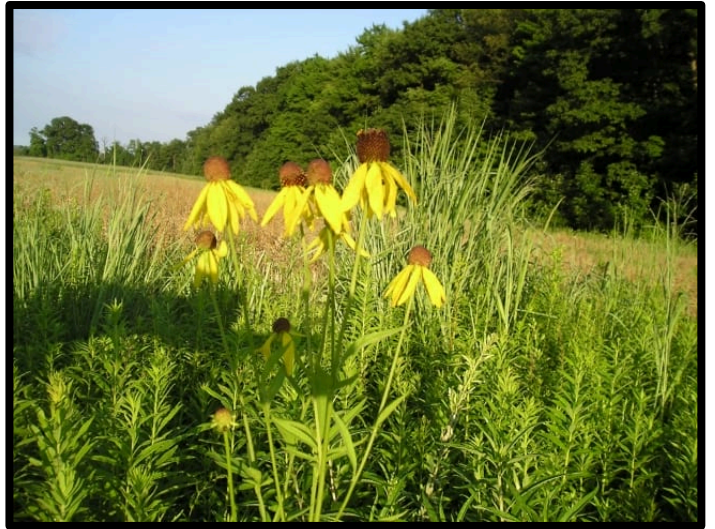
Gray-headed Coneflower ( Ratibida pinnata )