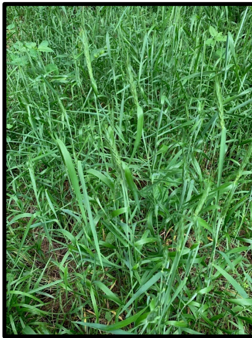
Virginia Wildrye ( Elymus virginicus )