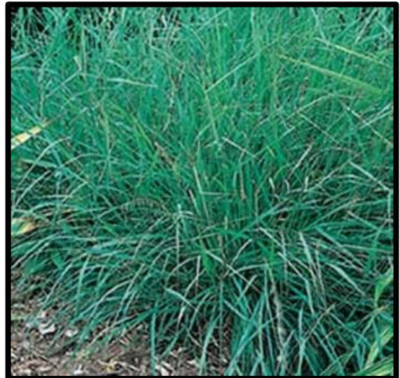
Sideoats Grama ( Bouteloua curtipendula )