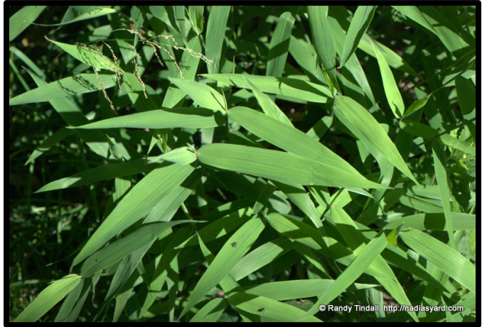
River Oats ( Chasmanthium latifolium )