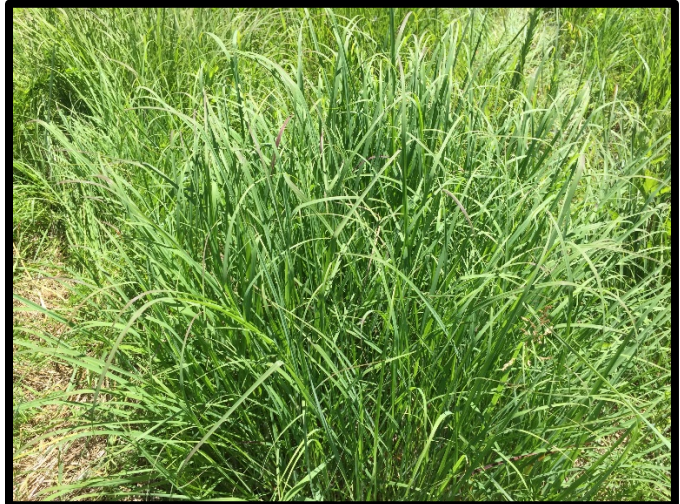
Big Bluestem ( Andropogon gerardii )