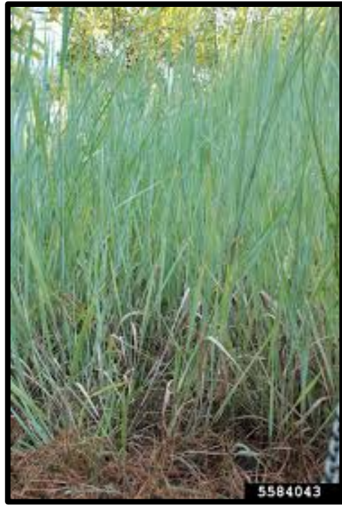
Indiangrass ( Sorghastrum nutans )