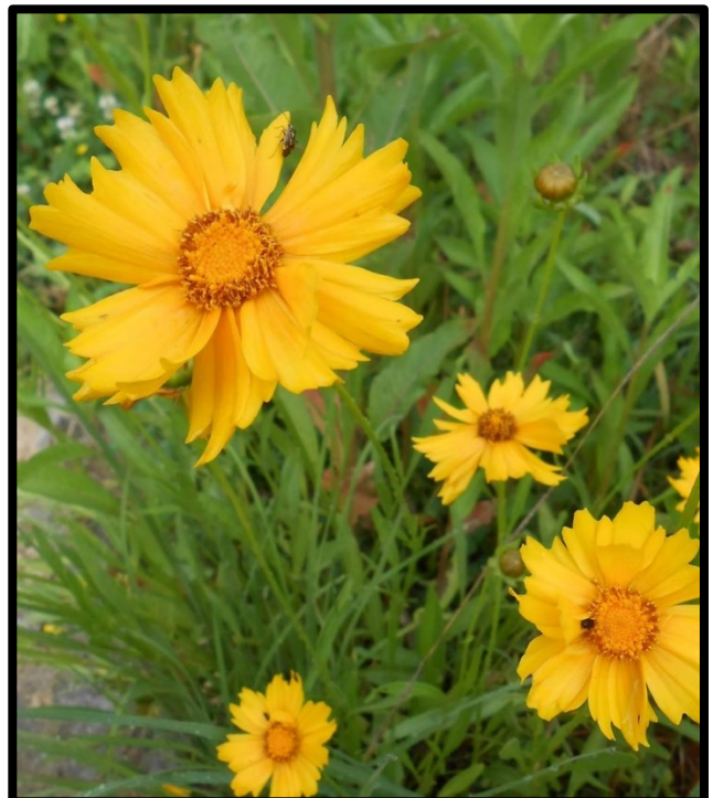
Lanceleaf Coreopsis ( Coreopsis lanceolata )