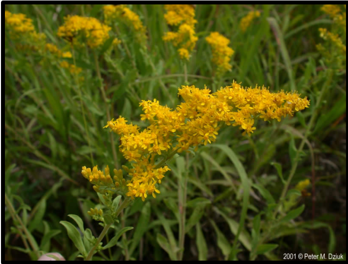
Gray Goldenrod ( Solidago nemoralis )