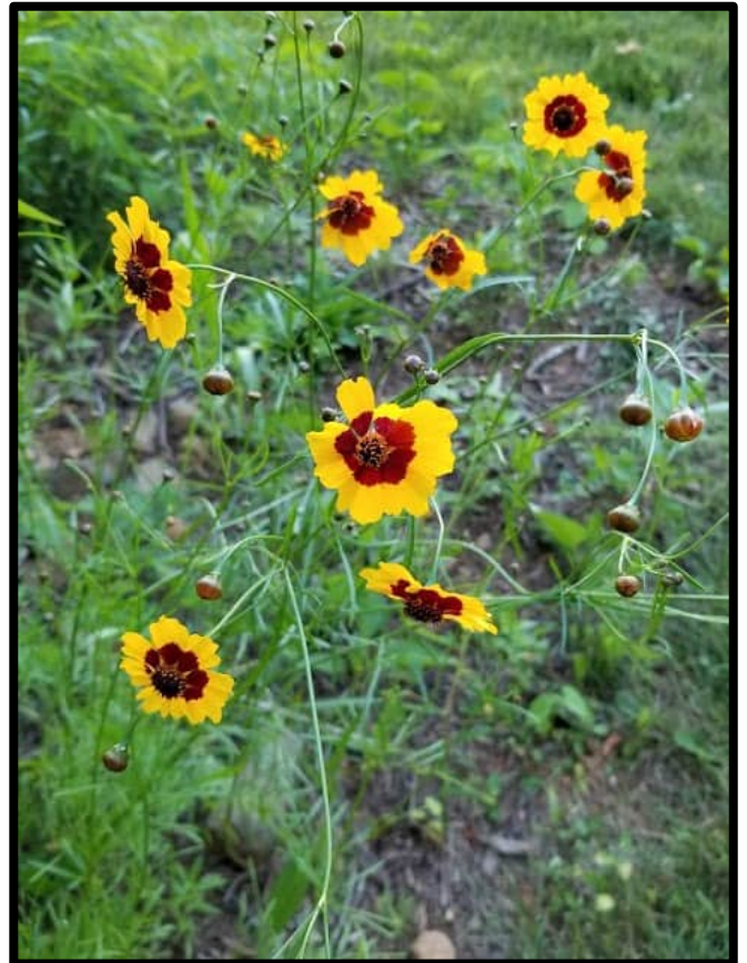
Plains Coreopsis ( Coreopsis tinctoria )