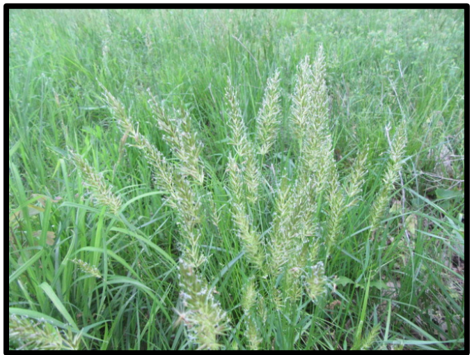
Prairie Junegrass ( Koeleria macrantha )