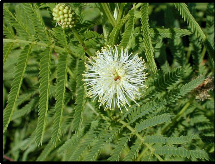
Illinois Bundleflower ( Desmanthus illinoensis )