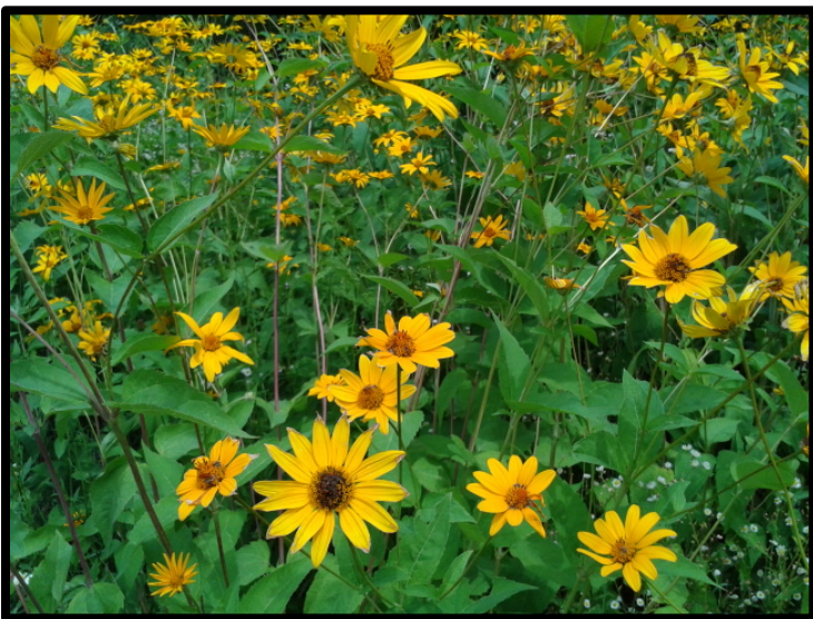
False Sunflower ( Heliopsis helianthoides )