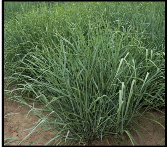
Switchgrass ( Panicum virgatum )