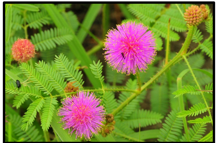
Sensitive Briar ( Mimosa quadrivalvus nuttallii )