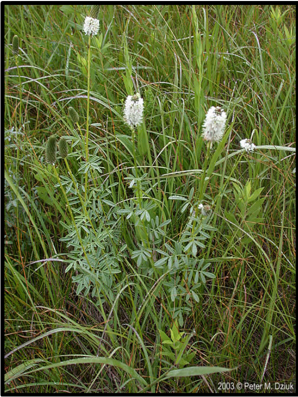
White Prairie Clover ( Dalea candida )