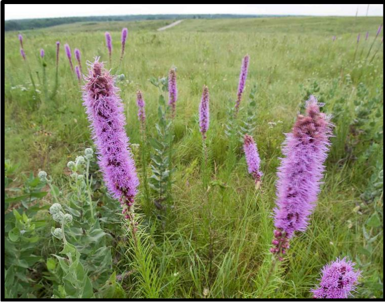
Prairie Blazing Star ( Liatris pycnostachya )