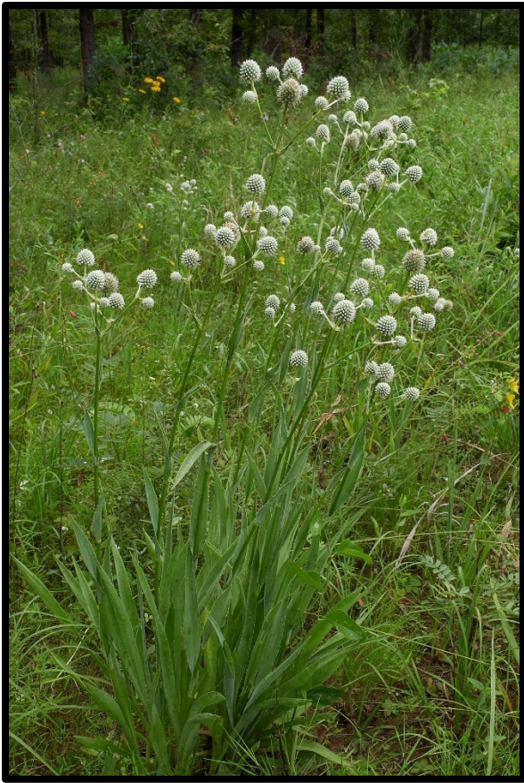
Rattlesnake Master ( Eryngium yuccifolium )