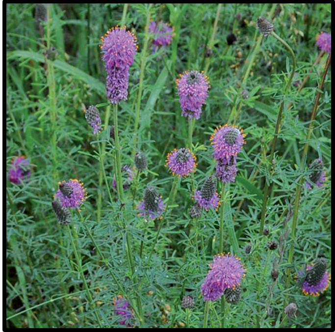
Purple Prairie Clover ( Dalea purpurea )