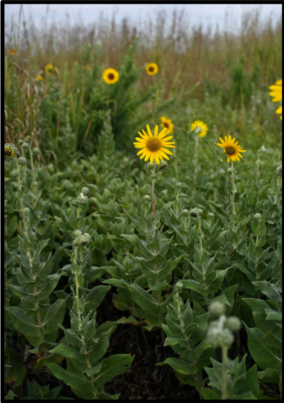
Ashy Sunflower ( Helianthus mollis )