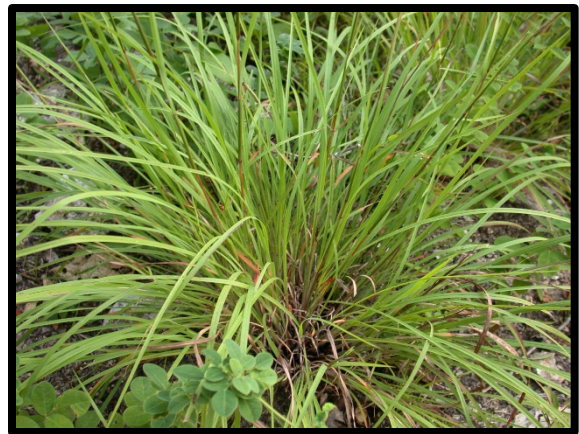
Little Bluestem ( Schizachyrium scoparium )