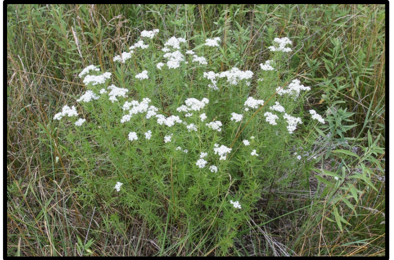
Slender Mountain Mint ( Pycnanthemum tenuifolium )