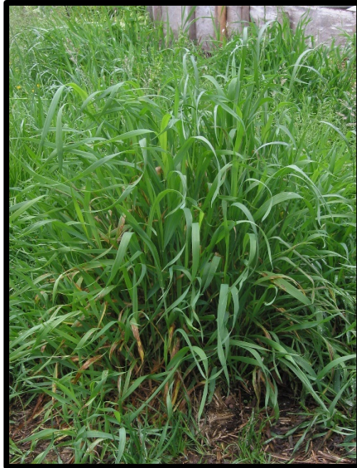
Canada Wildrye ( Elymus canadensis )