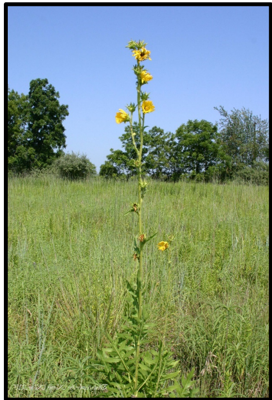
Compass Plant ( Silphium laciniatum )