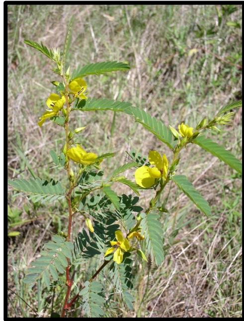
Partridge Pea ( Chamaecrista fasciculata )