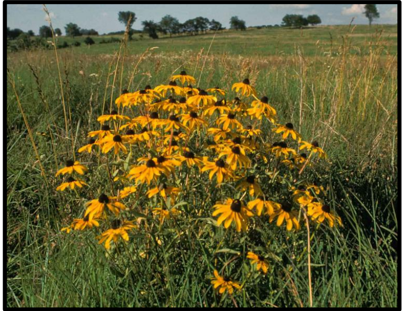
Black-eyed Susan ( Rudbeckia hirta )