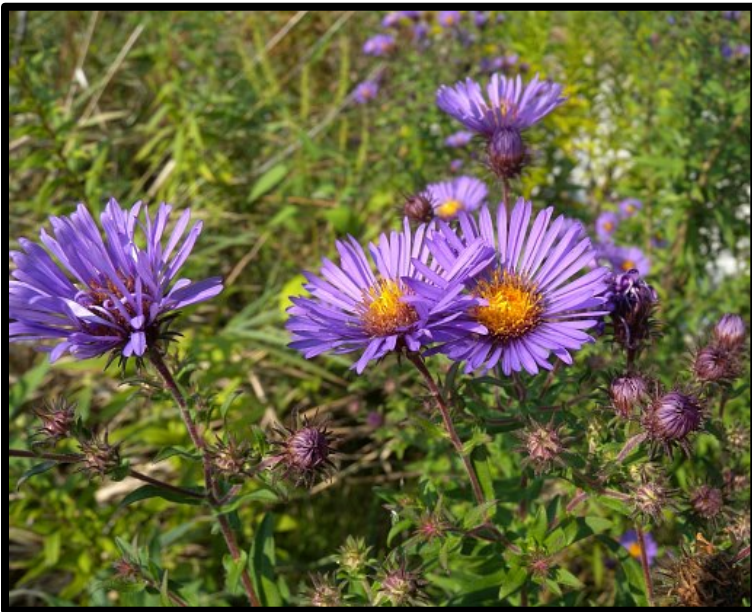
New England Aster ( Symphyotrichum novaeangliae )