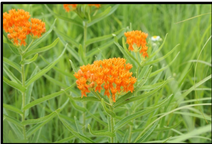
Butterfly Milkweed ( Asclepias tuberosa )