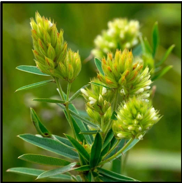
Roundhead Lespedeza ( Lespedeza capitata )