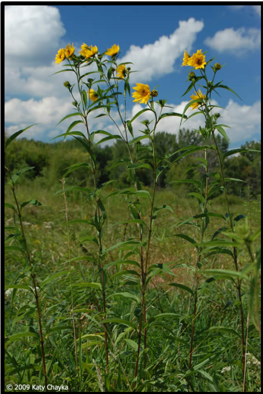
Sawtooth Sunflower ( Helianthus grosseserratus )