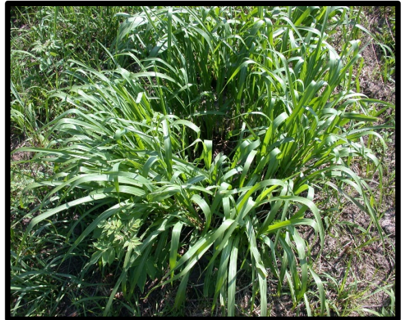
Eastern Gamagrass ( Tripsacum dactyloides )