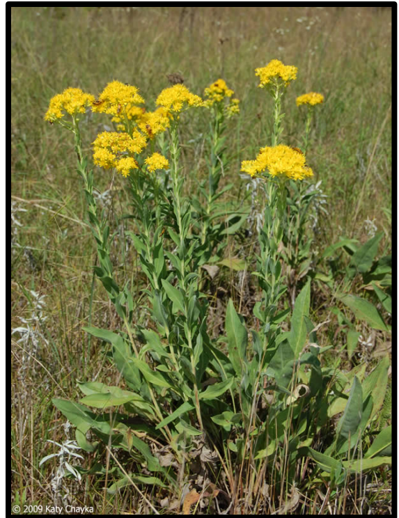
Stiff Goldenrod ( Solidago rigidum )