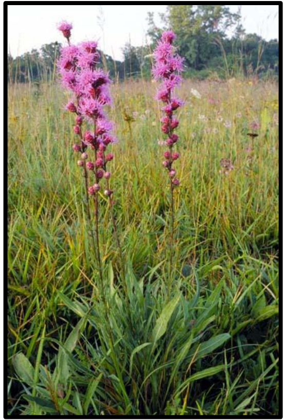
Rough Blazing Star ( Liatris aspera )