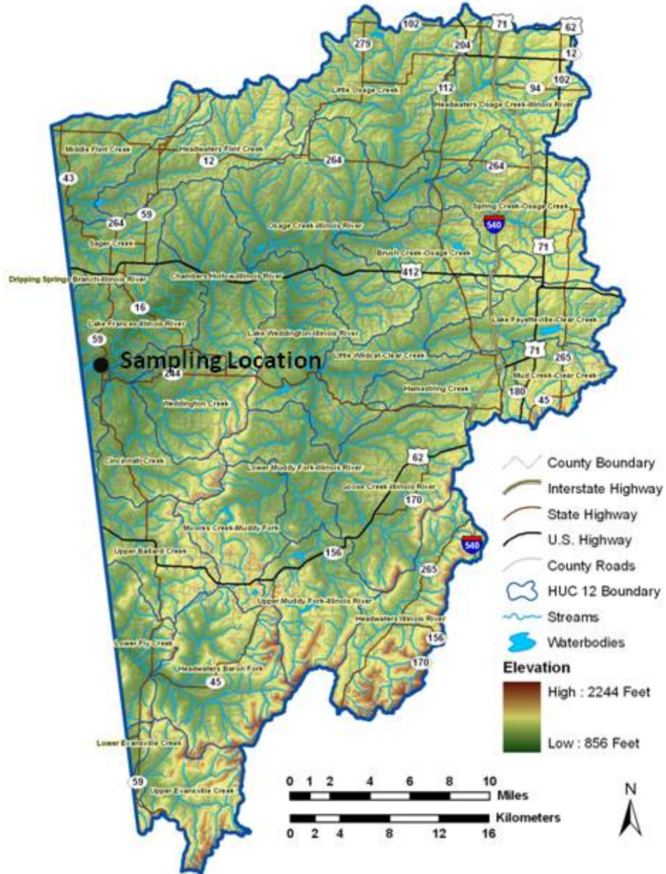
APPENDIX 1. Location of the sampling station on the Illinois River at Arkansas Highway 59, south of Siloam Springs, northwest Arkansas.