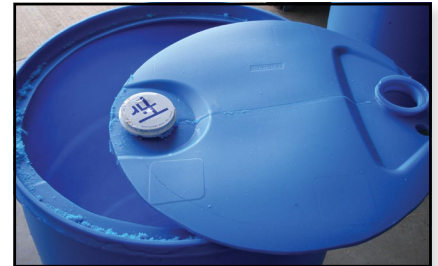
Barrel with top cut out.

Step 2: Cutting and drilling. Drill a 1" pilot hole in the top of the barrel to start your saw blade and cut the top out of the barrel using a jig saw or reciprocating saw. Make sure to leave at least a 1" rim to secure the fiberglass screen later. Next, drill the overflow hole at the top of your barrel with a 1" drill bit. Then drill the spigot hole using a 1 1/2" hole bit. Use a utility knife to smooth out the plastic burrs around all holes and cuts. Finally, clean the inside of the barrel to remove plastic shavings.