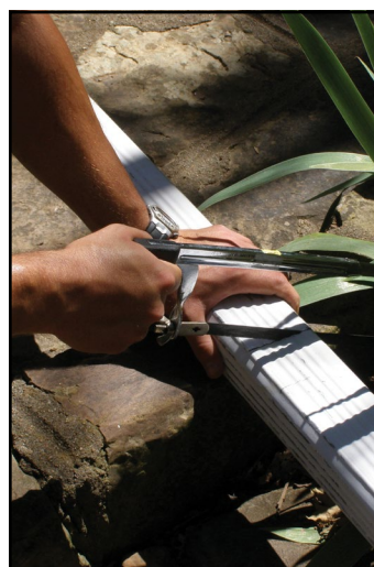
Making the gutter cut for new elbow placement.