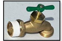
Spigot stem wrapped in plumber tape.

Step 1: Preparation. Mark all cuts and holes to be drilled on your clean 55-gallon barrel. The overflow hole can be located on either side of the barrel and should be at least 2 inches from the top edge of the barrel. The spigot hole should also be 2 to 3 inches from the bottom edge of the barrel.