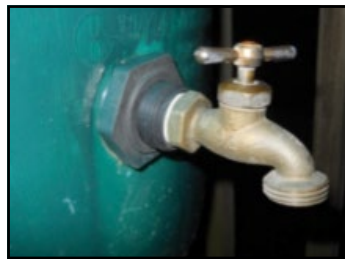
Spigot attached to a bulkhead tank fitting.

Once you know the height of the barrel, it is time