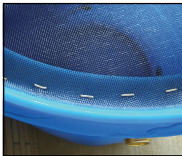
Screen stapled to top.