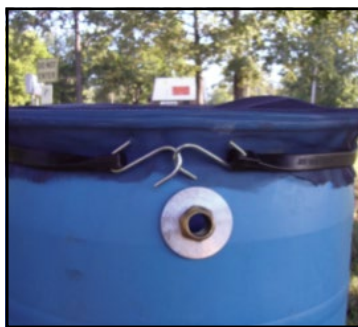
Screen fastened to top.

to cut the downspout. Disconnect the elbow at the bottom of your downspout. Hold the disconnected elbow up to the downspout to mark where to cut the downspout to provide at least 2 inches between the elbow and the rain barrel so the barrel can be easily removed for future maintenance. Cut the down spout at the line and reconnect the elbow to the downspout.