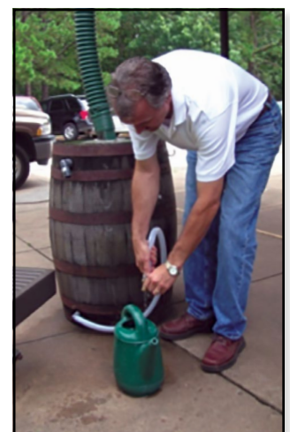
Rain barrel placed without a stand will have reduced water pressure.