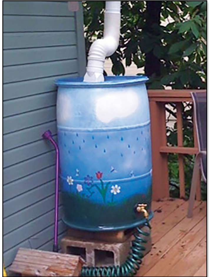
Painted rain barrel on stand with flexaspout attachment.

to cut the downspout. Disconnect the elbow at the bottom of your downspout. Hold the disconnected elbow up to the downspout to mark where to cut the downspout to provide at least 2 inches between the elbow and the rain barrel so the barrel can be easily removed for future maintenance. Cut the down spout at the line and reconnect the elbow to the downspout.